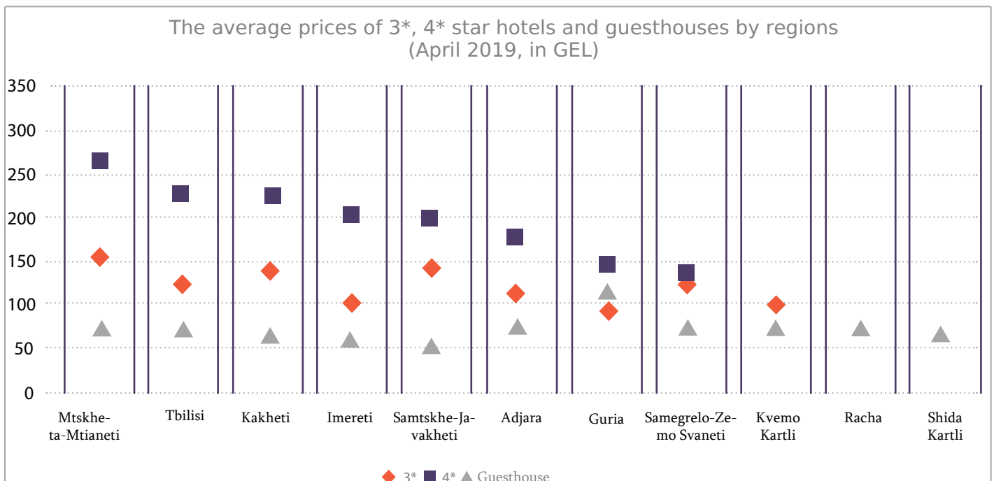
Graph 1: In the graph, average prices for standard double rooms in 3 and 4-star hotels and guesthouses are given by region. 5-star hotel prices are provided above.

The average cost of a room in a 5-star hotel in Georgia in April 2019 was 484 GEL per night. In Tbilisi, the average price was 525 GEL, followed by Adjara – 473 GEL, Samtskhe-Javakheti - 368 GEL, and Kakheti - 367 GEL.