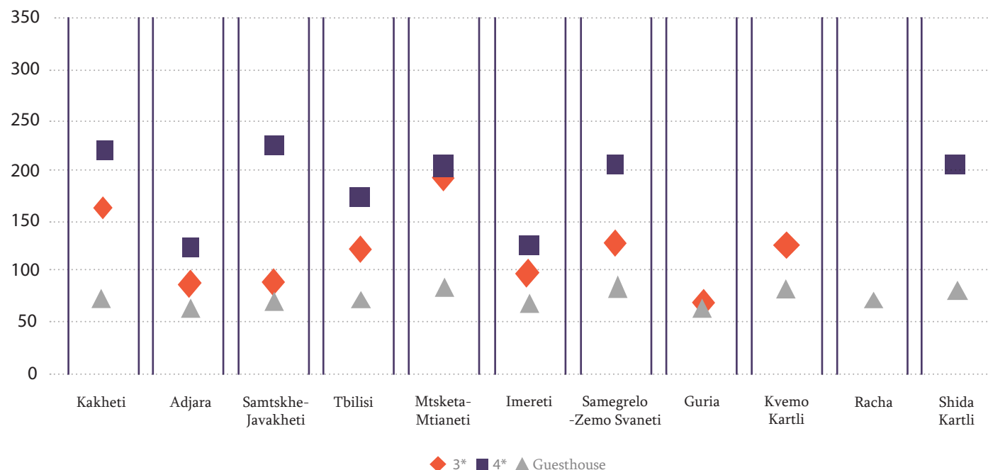
Graph 2: In the graph, average prices for standard double rooms in 3 and 4-star hotels and guesthouses are given by region. 5-star hotel prices are provided above.

The average prices of 3*, 4* star hotels and guesthouses by regions (April 2020, in GEL)