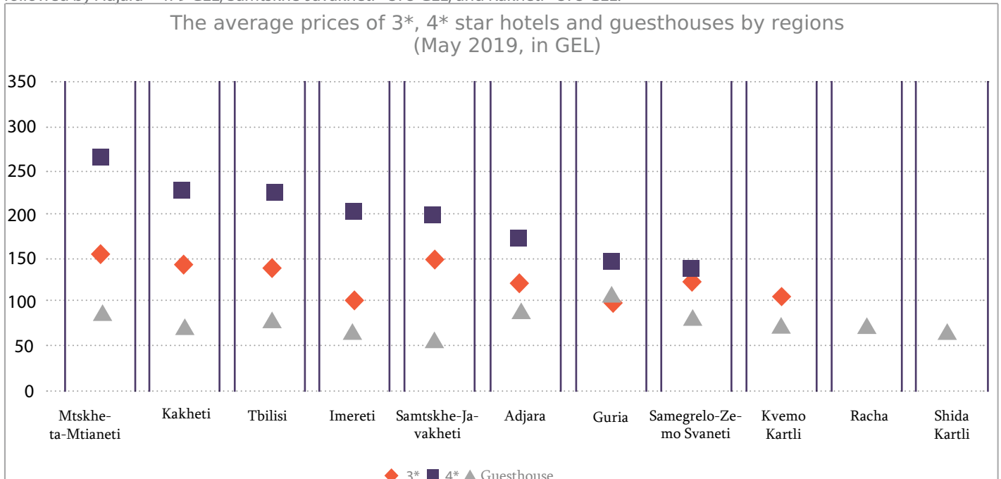
Graph 1: In the graph, average prices for standard double rooms in 3 and 4-star hotels and guesthouses are given by region. 5-star hotel prices are provided above.

The average cost of a room in a 5-star hotel in Georgia in May 2019 was 494 GEL per night. In Tbilisi, the average price was 612 GEL, followed by Adjara – 479 GEL, Samtskhe-Javakheti - 375 GEL, and Kakheti - 375 GEL.